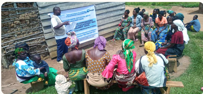
Community outreach session · Democratic Republic of the Congo

Deeper, evidence-based understanding of local SEA drivers, paired with stronger community complaints mechanisms.