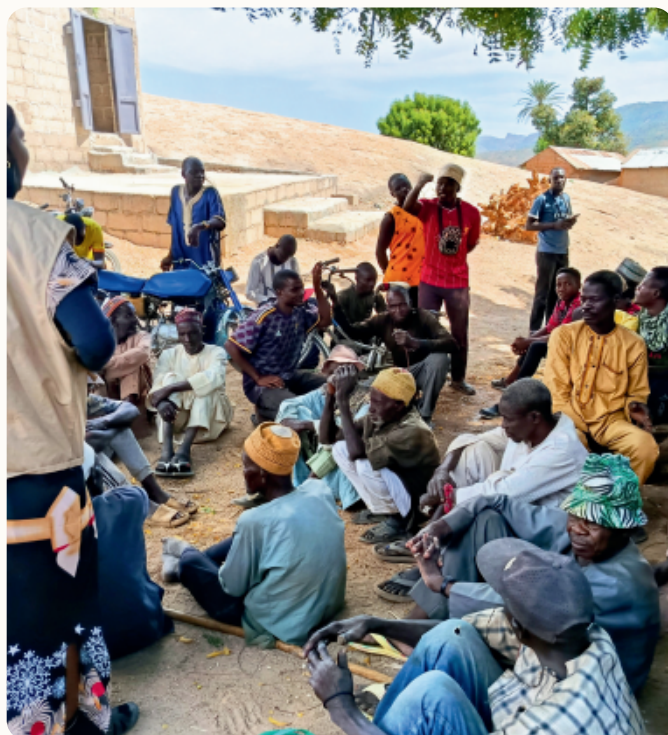
· Community outreach session · Adamawa State, Nigeria

Strengthened survivor support and PSEA mechanisms in two conflict-affected LGAs of Adamawa State.