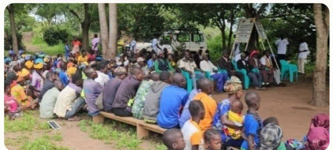
Community outreach session · Batangafo, Central African Republic

Reinforced SEA zero-tolerance norms anchored in community-endorsed commitments and trusted local structures.