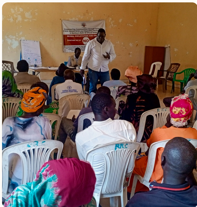
Community outreach session · Northern Bahr El Ghazal, South Sudan